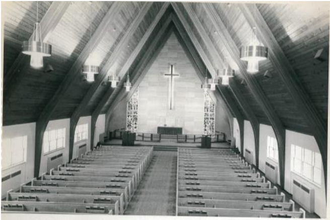
Sanctuary (date unknown).

Do you know when these photos might have been taken?