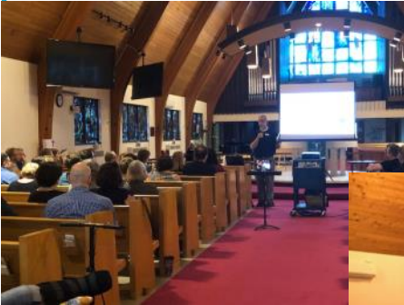
The Monday night session of "One People of God"