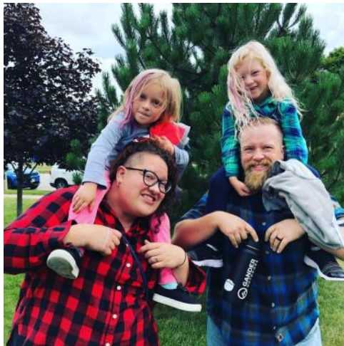
"Kick-Off Fest 2019"